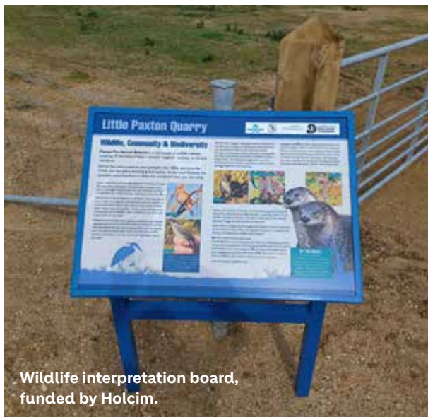
Wildlife interpretation board, funded by Holcim.