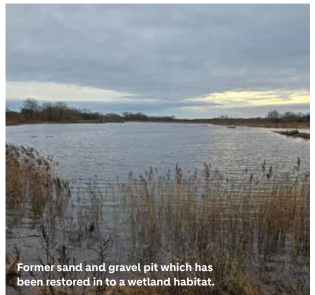
Former sand and gravel pit which has been restored in to a wetland habitat.