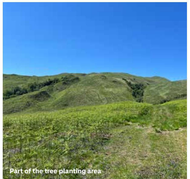
Part of the tree planting area