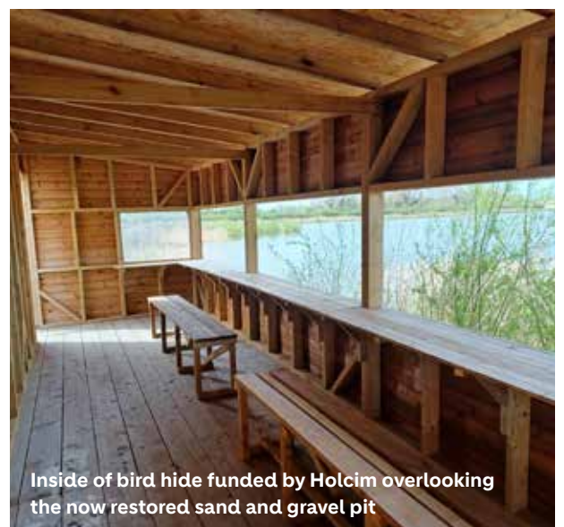
Inside of bird hide funded by Holcim overlooking the now restored sand and gravel pit