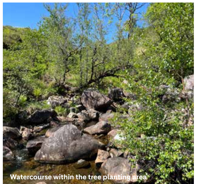
Watercourse within the tree planting area