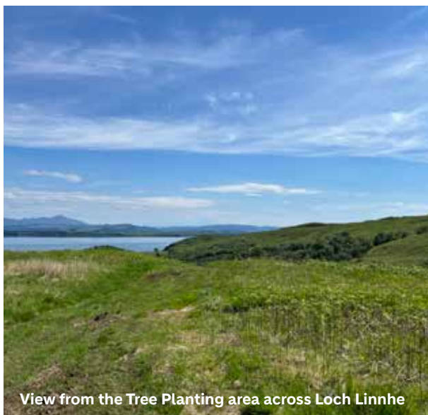
View from the Tree Planting area across Loch Linnhe