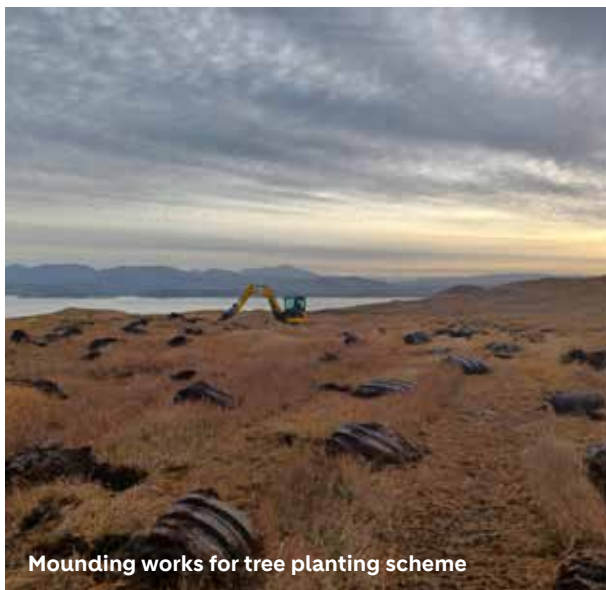
Mounding works for tree planting scheme