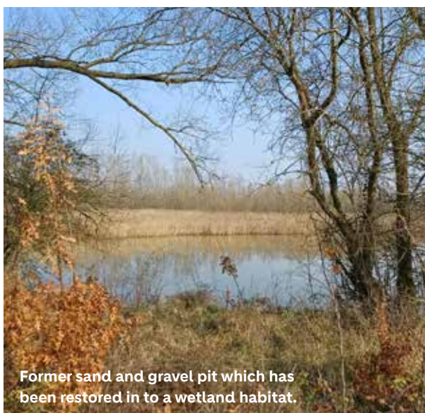
Former sand and gravel pit which has been restored in to a wetland habitat.